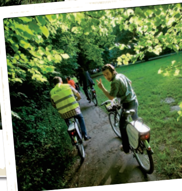
durch den Auewald