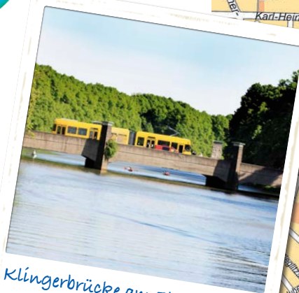
Klingerbrücke am Elsterflutbett